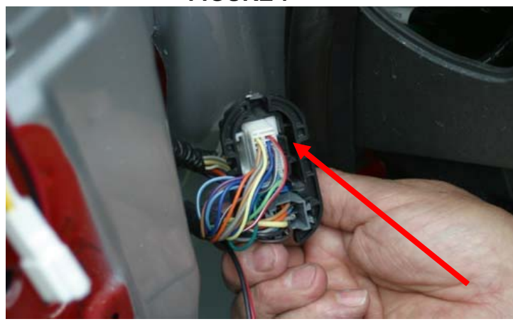
FIGURE 7 FIGURE 8