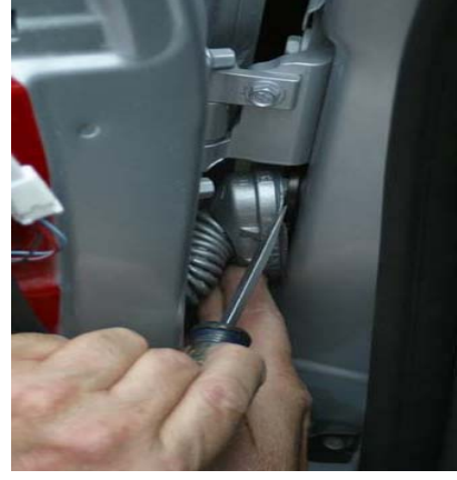
FIGURE 5 FIGURE 6