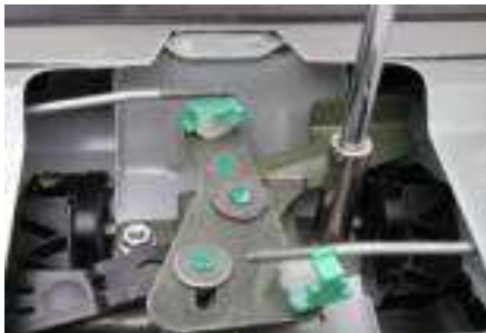
PHOTO # 12