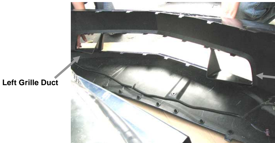
Left Grille Duct