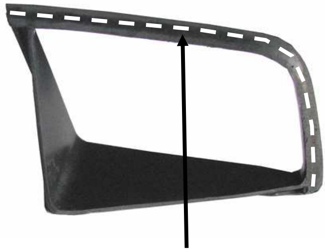
Top Of Grille Duct