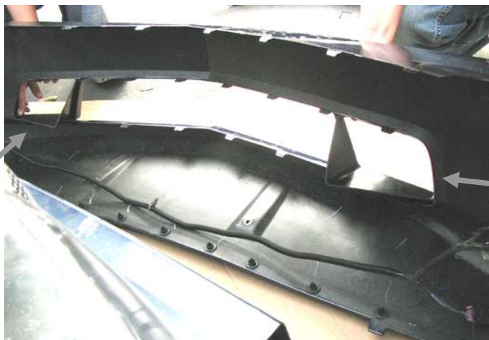
Right Grille Duct

8. Now your ready to install fascia back onto the vehicle in reverse order as you took off.