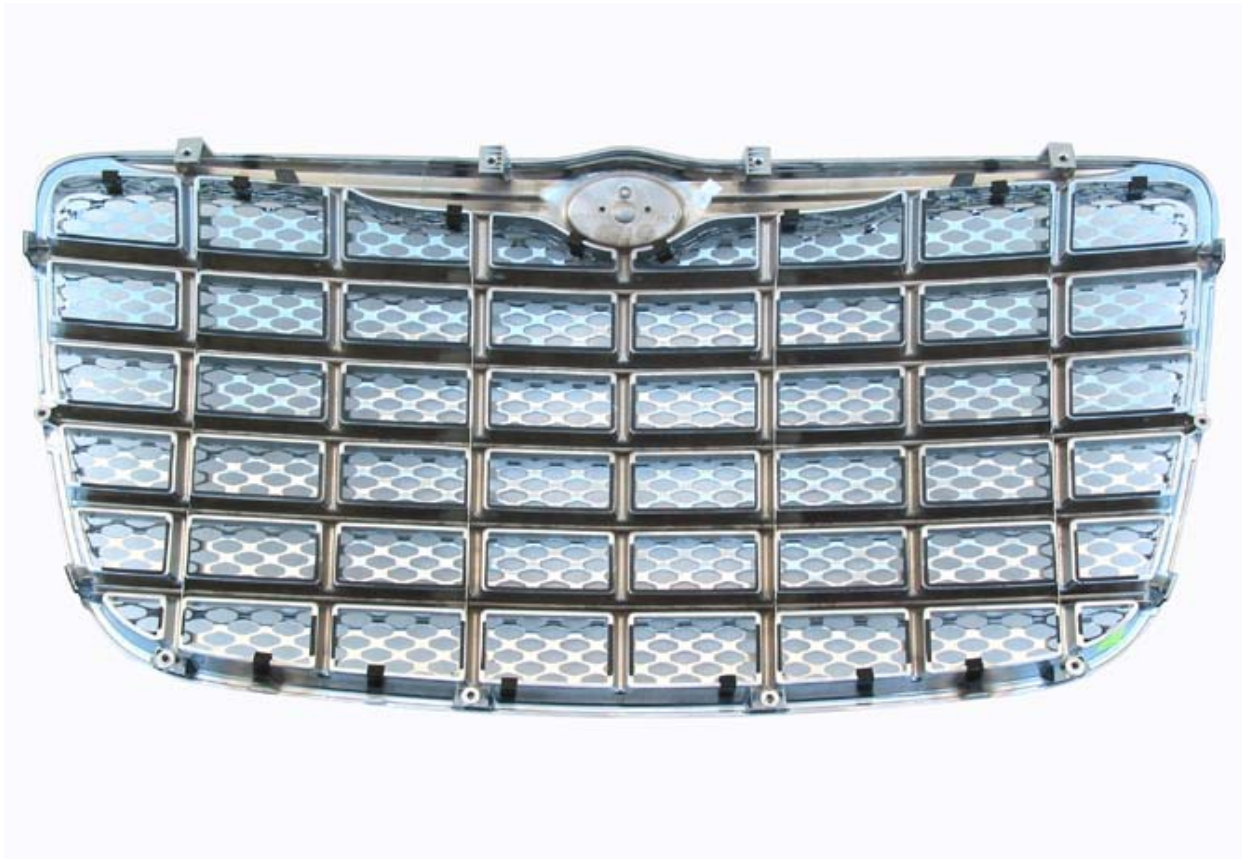
PHOTO FOR CLIP PLACEMENT

Install the grille shell back into vehicle in the reverse order of removal. DO NOT over tighten the fasteners that go into the Styrofoam.