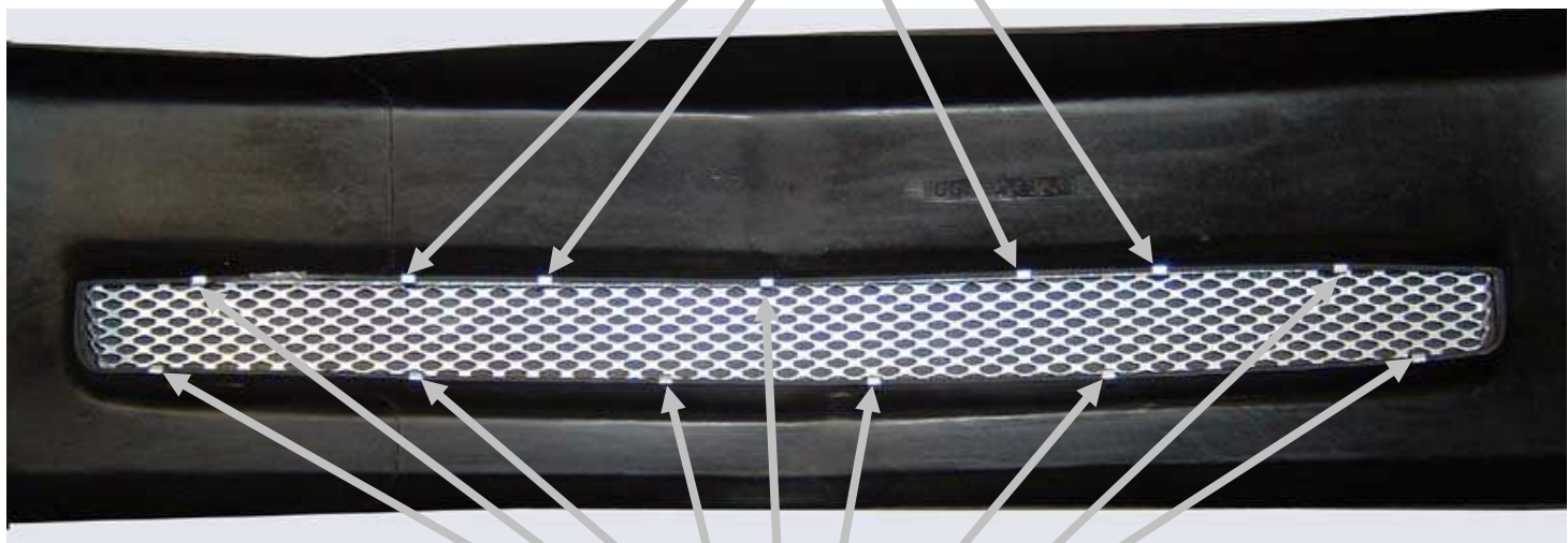
Installation Clips # 71099 1 1/8 Long

THE SPEED GRILLE™ may be covered by one or more of the following U.S. Patents: D427,119,D425,834,D421,585,D420,961,D420,960,D420,959, and D420,958 may be covered by one or more pending U.S. Patent applications.