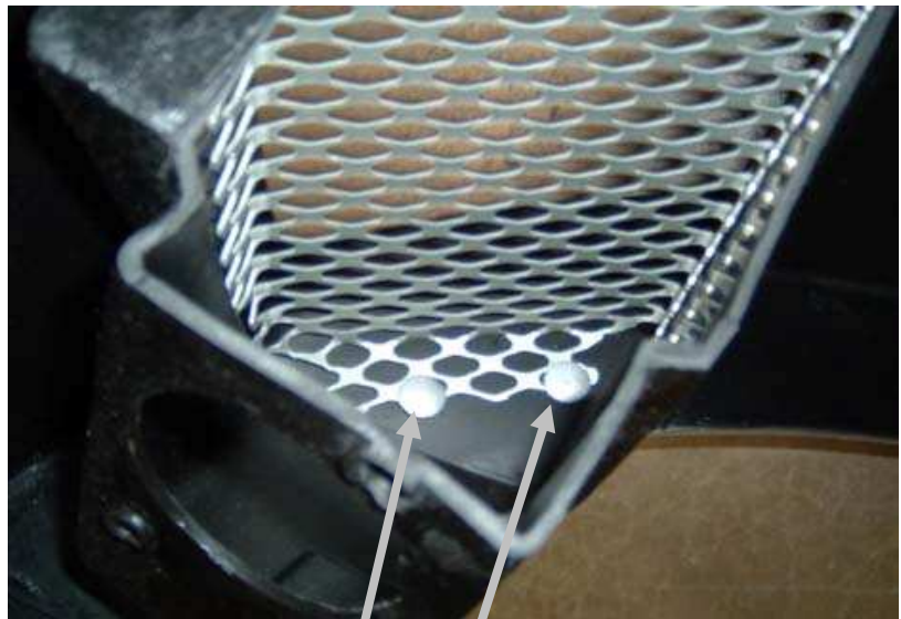
Push In Fasteners