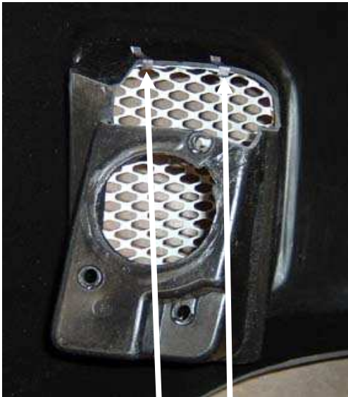
Installation Clips 3/4" Long