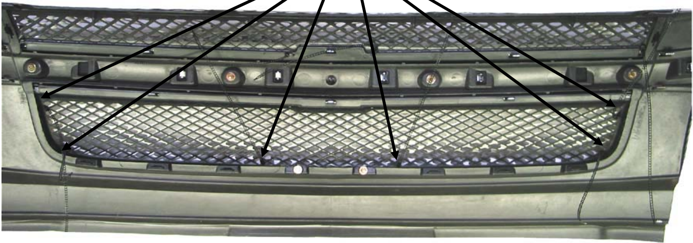
PHOTO 5 Ladder Ties