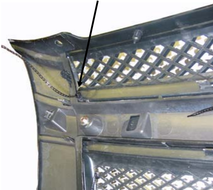
Driver's Side Bottom Top