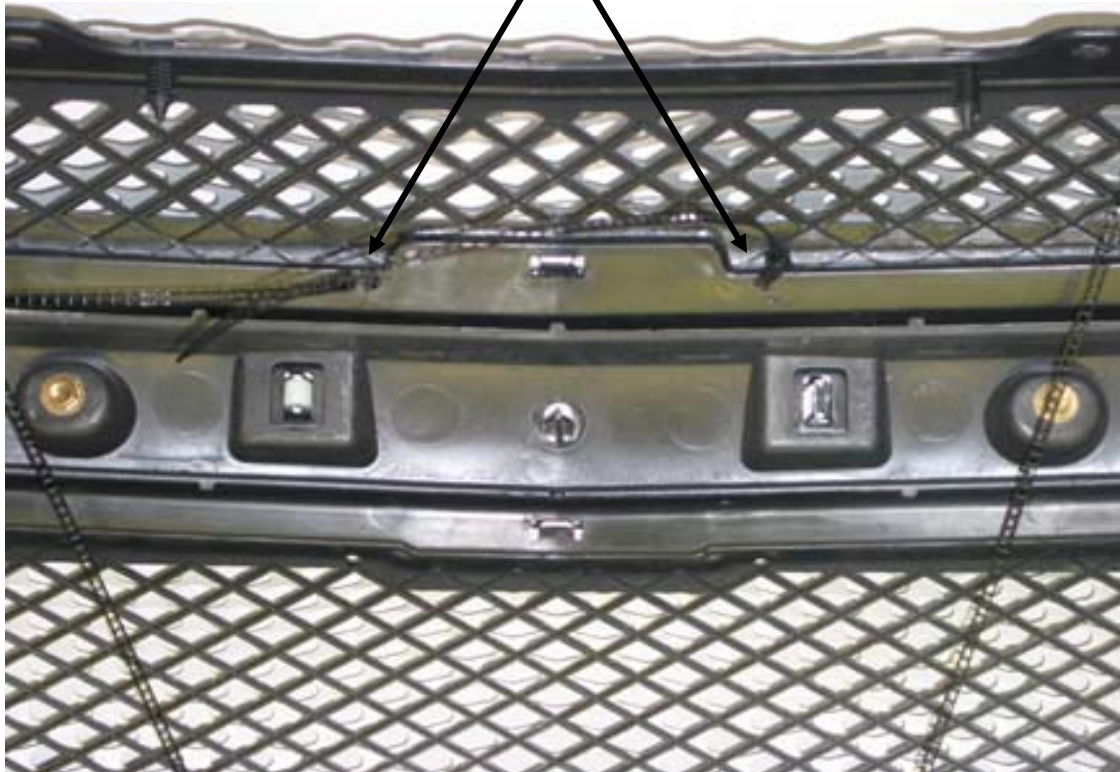
Drill Holes 3/16" For Ladder Ties