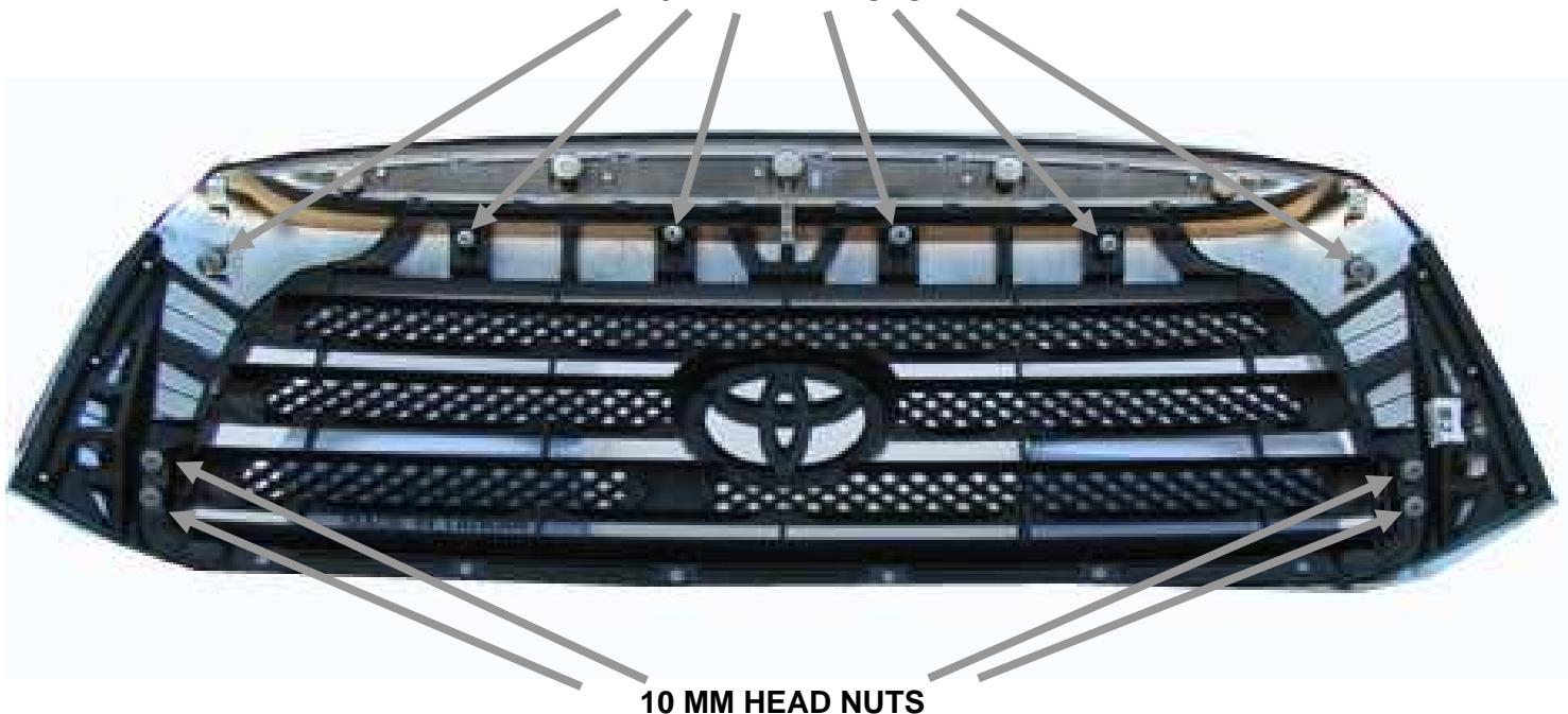
PHOTO 1 10 MM HEAD NUTS

THE SPEED GRILLE™ may be covered by one or more of the following U.S. Patents: D427,119,D425,834,D421,585,D420,961,D420,960,D420,959, and D420,958 may be covered by one or more pending U.S. Patent applications.