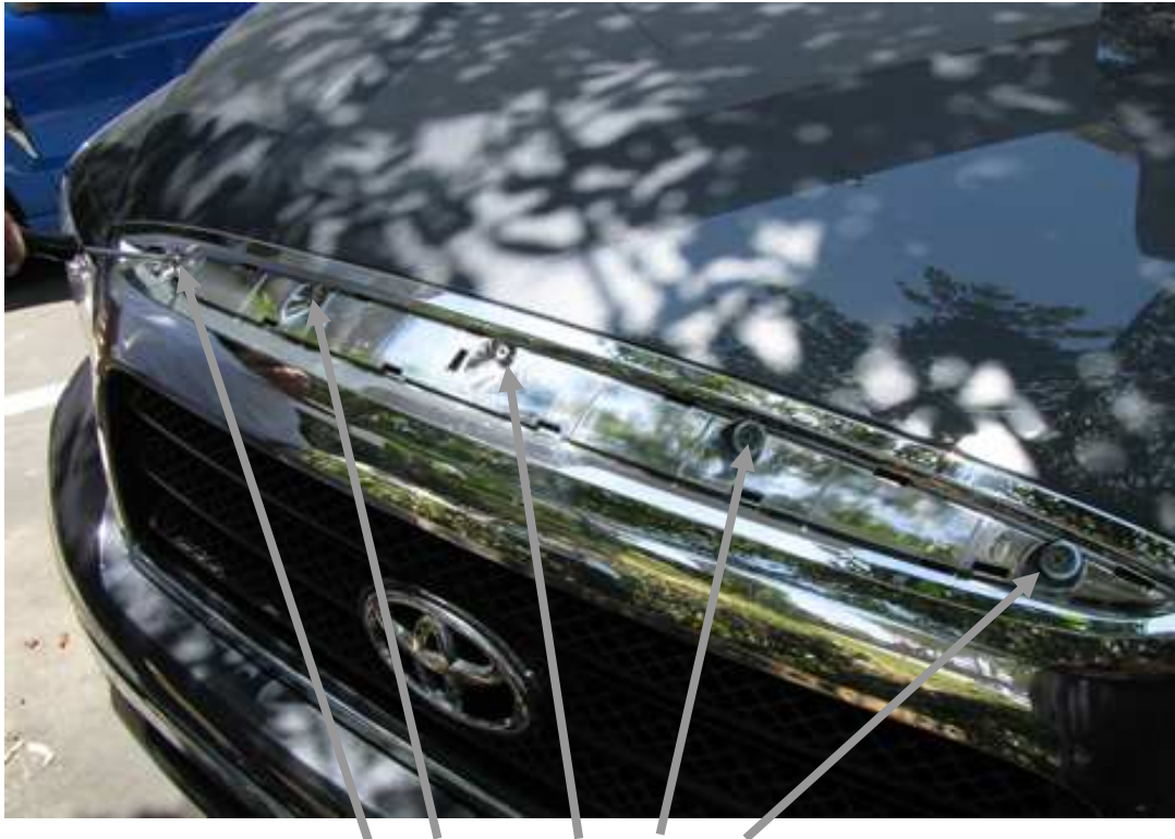
10 MM HEAD BOLTS