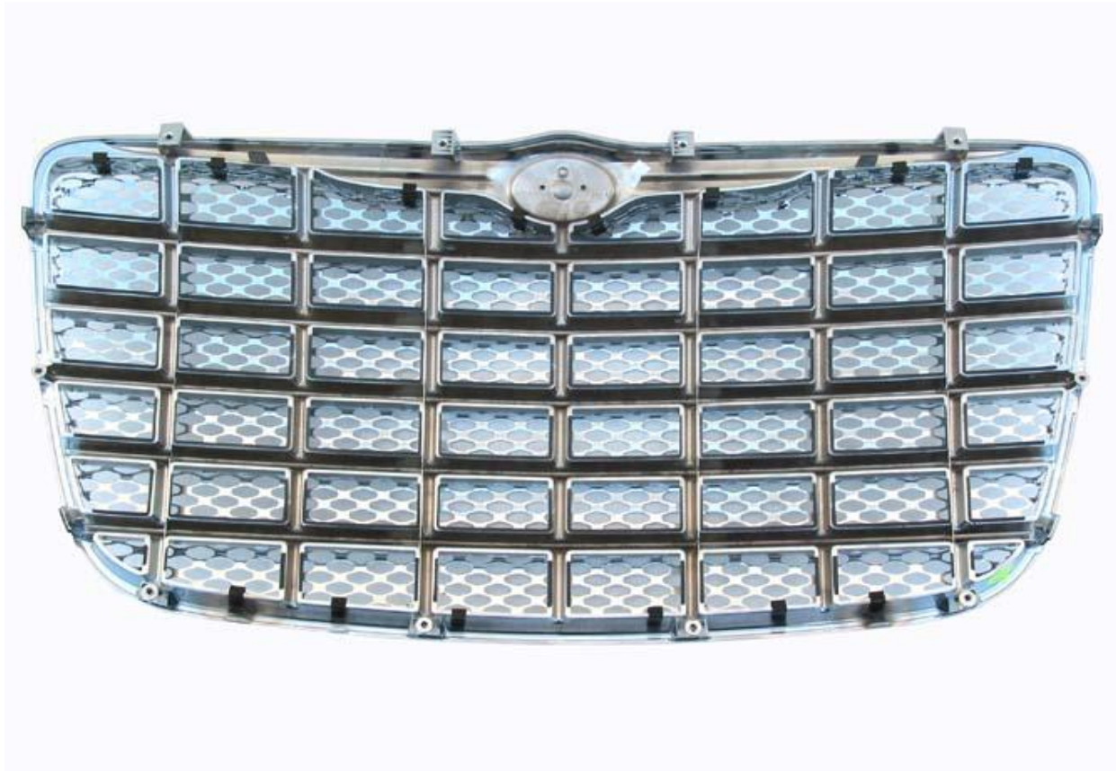
PHOTO FOR CLIP PLACEMENT

Install the grille shell back into vehicle in the reverse order of removal. DO NOT over tighten the fasteners that go into the Styrofoam.