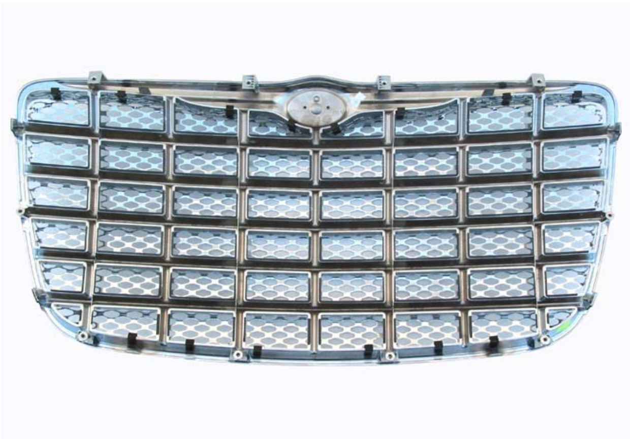
PHOTO FOR CLIP PLACEMENT

Install the grille shell back into vehicle in the reverse order of removal. DO NOT over tighten the fasteners that go into the Styrofoam.