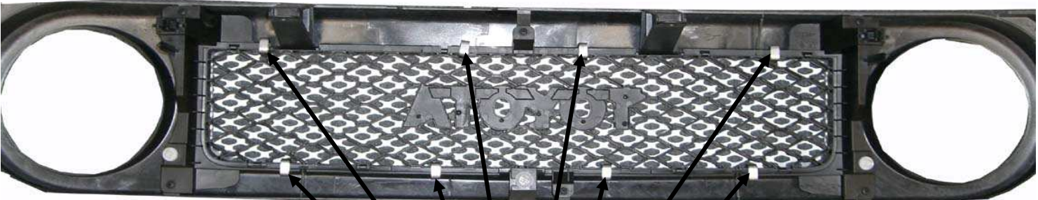
Installation Clips TYPICAL CLIPPING INSTALLATION